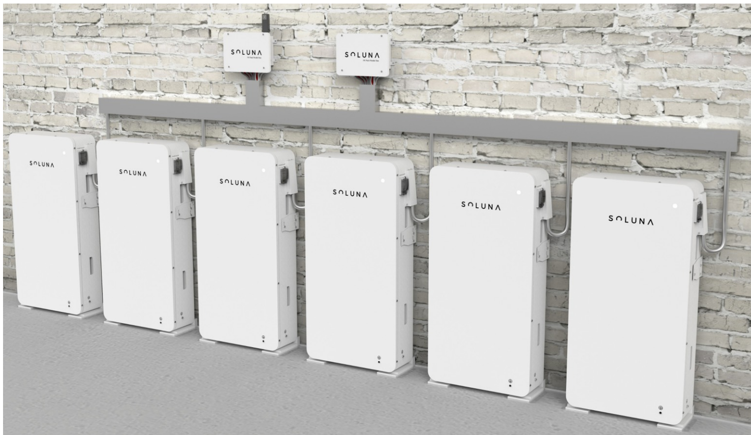
Diagram for 10 units parallel connection